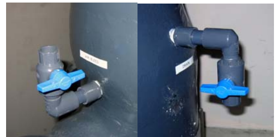
Air Bleed and Drain Valves