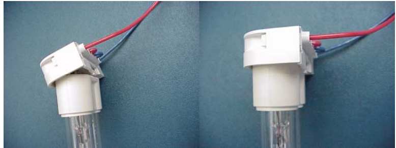
Bulb Pin Socket Assembly